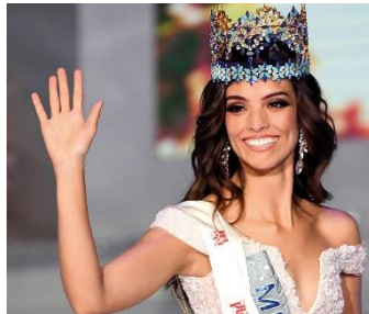
Vanessa Ponce of Mexico Reigning Miss World