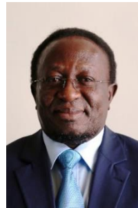
Dr. Harrison George Mwakyembe Minister for Information, Culture, Arts & Sports, Member of Parliament